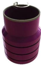
Dissectors (Clock Wise) 5mm COD.: OZ011T . 6mm COD.: OZ011.03