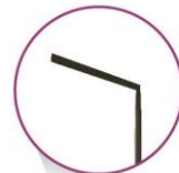
Glider COD.: OE043