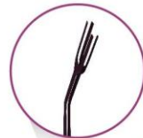
Fixating Forceps COD.: OF030