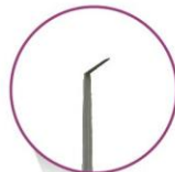
Suarez Spreader COD.: OK025