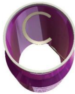
Dissectors (Counter Clock Wise) 5mm COD.: OZ011.01T 6mm COD.: OZ011.04