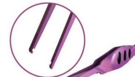
Implantation Forceps COD.: OF174