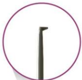
Micro Dissector COD.: OE035