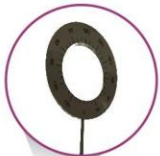
Mendez's Transfer COD.: OZ006