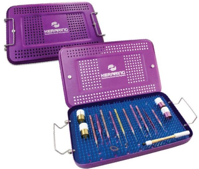
Sterilization Case COD.: KCASE