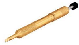
Diamond Knife COD.: KNIFE