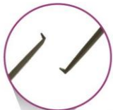
Double Sinskey Hook COD.: OE020