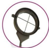
Optical Zone Marker (5mm) COD.: OM014 (6mm) COD.: OM014.02