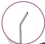
Ring Pusher COD.: OT018